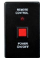
Remote Control 🔍