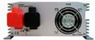
Back Panel 🔍