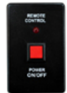
Remote Control 🔍