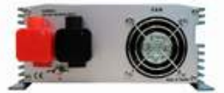
Back Panel 🔍