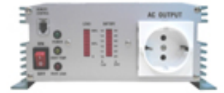
Front Panel 🔍