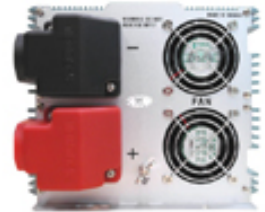
Back Panel 🔍