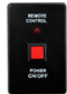
Remote Control 🔍