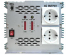
Front Panel 🔍