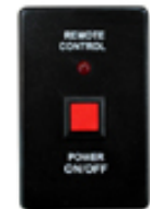
Remote Control 🔍